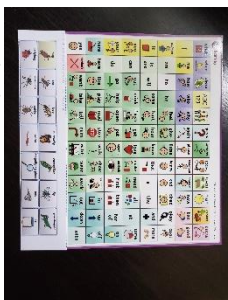
Attached to a one-page communication board.

The following strips can be used as choice boards or fringe vocabulary for the above activity. If you are using this as fringe vocabulary, you will need one of our low-tech flip books or a single page communication board. These boards are available on our website. Download the boards here: https://saltlilo.com/chatcorner/content/29 You can add these a flip book. OR, you can Velcro these to the top/bottom of a single page low-tech core word board.