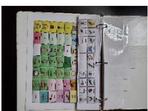
Added to the WP 42 Basic flip book.

You can add me with the WordPower 60 Basic Flip Book to the "Groups" tab.