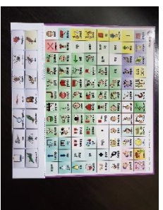
Attached to a one-page communication board.

The following strips can be used as choice boards or fringe vocabulary for the above activity. If you are using this as fringe vocabulary, you will need one of our low-tech flip books or a single page communication board. These boards are available on our website. Download the boards here: https://salttillo.com/chatcorner/content/29 You can add these a flip book. OR, you can Velcro these to the top/bottom of a single page low-tech core word board.