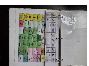
Added to the WP 42 Basic flip book.

You can add me with the WordPower 60 Basic Flip Book to the "Groups" tab.