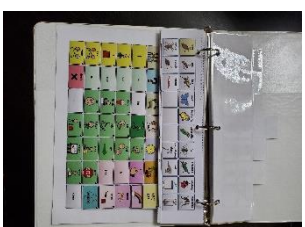
Attached to a one-page communication board.