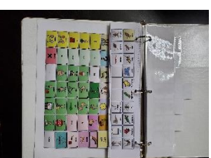
Added to the WP 42 Basic flip book.

You can add me with the WordPower 60 Basic Flip Book to the "Groups" tab.