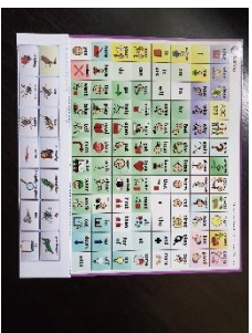
Attached to a one-page communication board.

The following strips can be used as choice boards or fringe vocabulary for the above activity. If you are using this as fringe vocabulary, you will need one of our low-tech flip books or a single page communication board. These boards are available on our website. Download the boards here: https://salttillo.com/chatcorner/content/29 You can add these a flip book. OR, you can Velcro these to the top/bottom of a single page low-tech core word board.