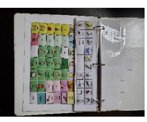
Added to the WP 42 Basic flip book.

You can add me with the WordPower 60 Basic Flip Book to the "Groups" tab.