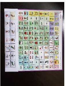
Attached to a one-page communication board.

The following strips can be used as choice boards or fringe vocabulary for the above activity. If you are using this as fringe vocabulary, you will need one of our low-tech flip books or a single page communication board. These boards are available on our website. Download the boards here: https://saltillo.com/chatcorner/content/29 You can add these to a flip book. OR, you can Velcro these to the top/bottom of a single page low-tech core word board.