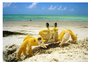
Maybe you will see a crab on the beach!