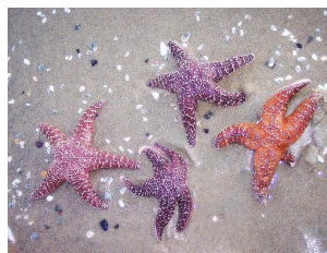
You might even find a starfish!