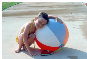
At the beach, you can play with a beach ball.